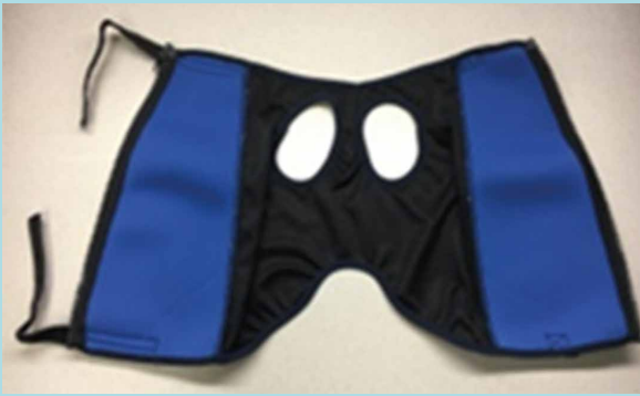
Image 1: Lomir custom swine protective jacket #1 with zipper and Velcro closure