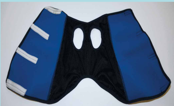
Image 2: Lomir custom swine protective jacket #2 with Velcro closure only

removing from the pig as well as durability and long-term wear (Images 1 and 2).